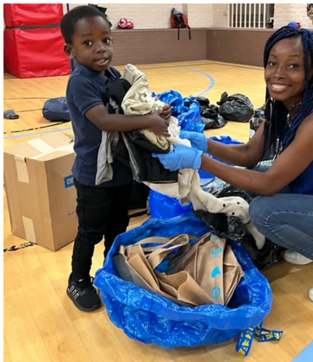
Organising clothes donations for people who are homeless, with ASLAN.

‘I loved the freedom of being able to do as much as you could, whilst having your children there.’