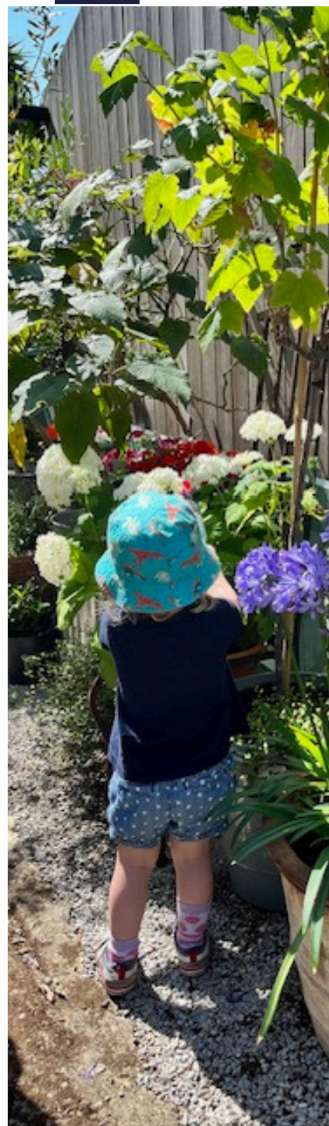
Plant watering at Roots and Shoots