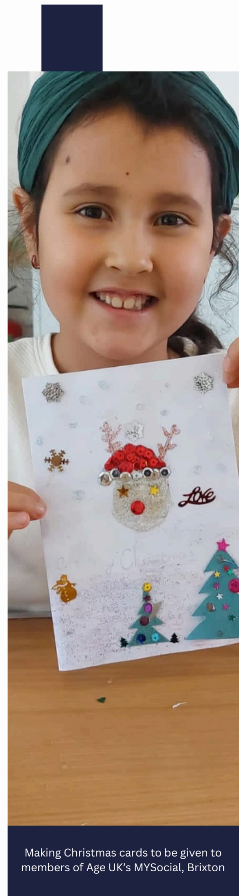
Making Christmas cards to be given to members of Age UK's MYSocial, Brixton

‘Interactive, well run, friendly organisers, meeting other local families... the activity, safe space for kids, feeling of helping the community.’