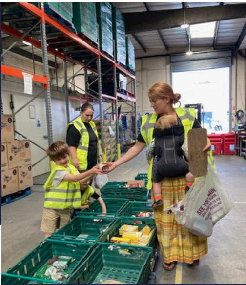
Helping create food parcels at The Felix Project

We want to benefit thousands of families every week, and transform opportunities for children to participate in community at a young age - helping to nurture the next generation of change-makers.