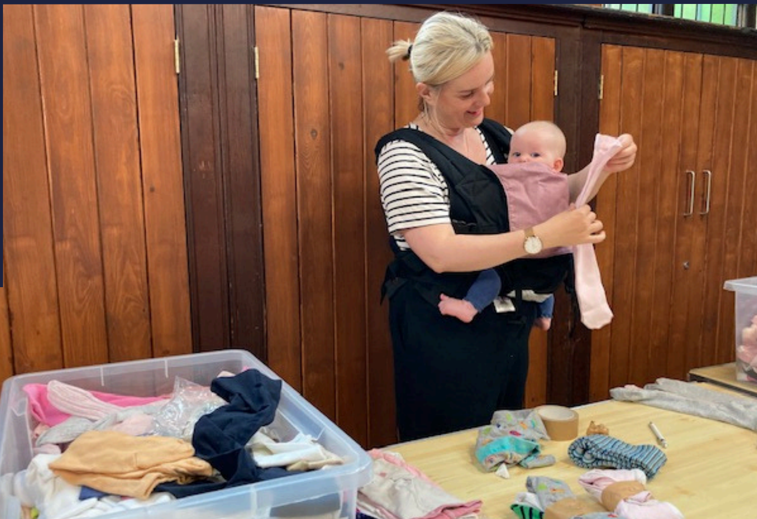
Organising baby clothes donations for Little Village

We are at an exciting point in our journey of growth, and are now recruiting for a Treasurer to join our Board of Trustees.